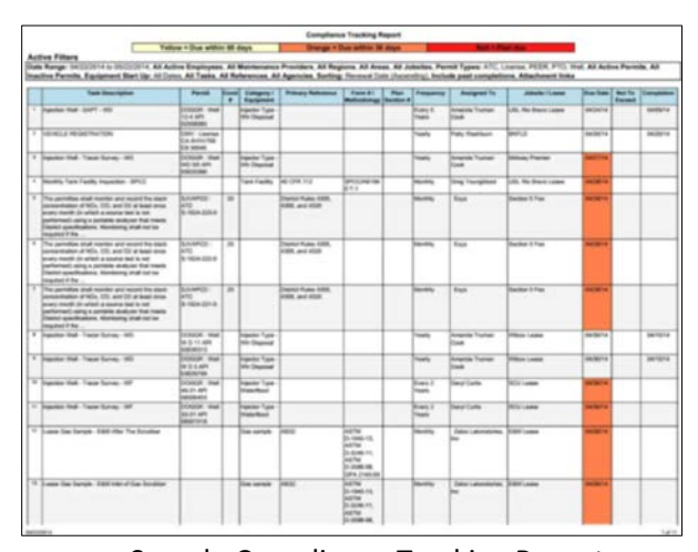
Sample Compliance Tracking Report